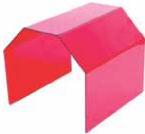
Guinea Pig Hut